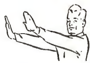
Interference with forward pass