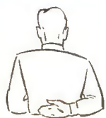
Illegal forward pass