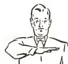
Illegal motion or formation at snap