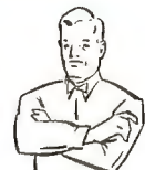
Delay of game or excess time out