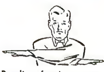
Penalty refused, incomplete pass, missed goal, etc.