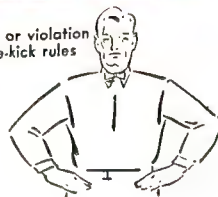
Off-side or violation of free-kick rules