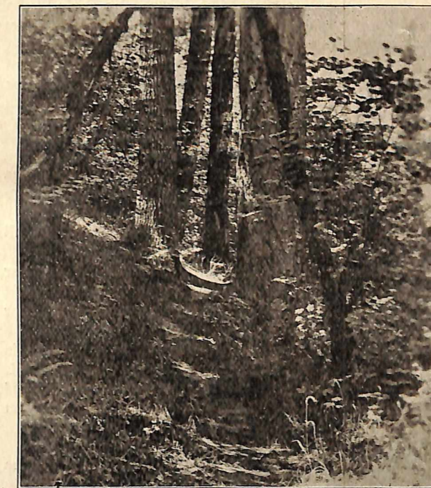
FOOT PATH NEAR COLLEGE CANON

The attendance at our Christian Endeavor meetings and church services is much better than it has been. We as Endeavorers are trying to increase our attendance each month and grow in interest. There is good interest being manifested.