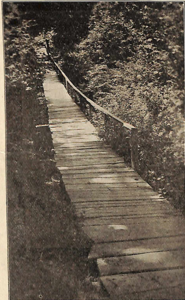
FOOT BRIDGE NEAR COLLEGE

The unmarried men were to play ball against the married men Tuesday evening, July 22. Everybody came but the married men. We wonder why?