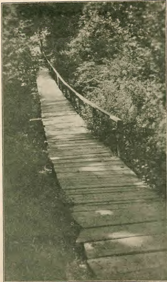
Foot Bridge Across College Canon