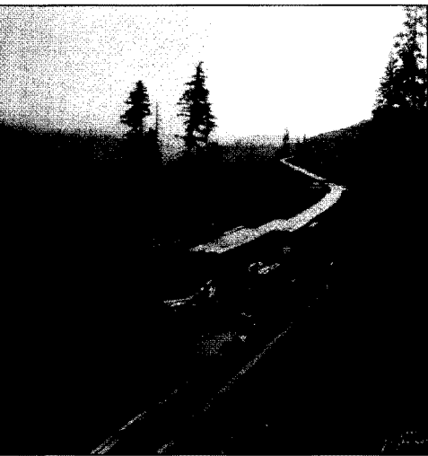
Part of the Kittitas Irrigation Canal, this is the junction of two different types of irrigation flumes in Kittitas County, and just one facet of the Columbia Reclamation project.

any more forthcoming in praise. Dill's unique political position in the state thus contributed to his propensity for self-promotion. If he hadn't promoted himself through his vast letter-writing and public appearances, his constituents would seldom have heard about his efforts on their behalf.