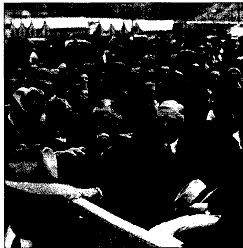
Franklin D. Roosevelt (behind the microphone), who visited the Grand Coulee Dam site in 1934, was an avid supporter of the dam project, public power, and irrigation of arid lands.

Dill used history to provide a philosophical base for his politics and material for his oratorical performances. The spoken word was his lifelong love, but it was a blind romance. He did not notice when the oratorical style that had made William Jennings Bryan so popular, the style he had adopted as his own, lost its ability to impress most Americans. Dill's persistence in speaking in the oratorical style that had helped send him to the Senate in 1922 caused many later observers to esteem him lightly and believe he had significantly exaggerated his accomplishments. Indeed, for many he became the living stereotype of the old-time machine politician: tainted with graft, a blowhard, and a has-been—not the complicated political maverick that he has been portrayed in my book. Those who remembered him as he had truly been regarded him differently from those who knew him only in his later years. The correspondence between Dill and Warren Magnuson is full of the latter's respect for the old senator.