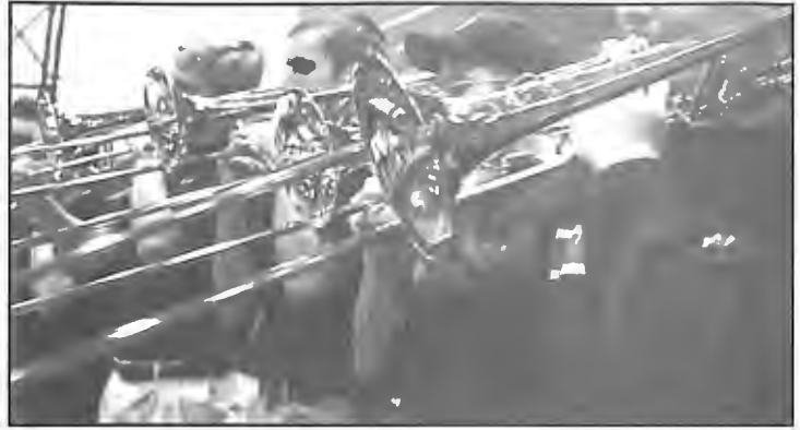
PEP BAND: The student-run George Fox Pep Band provides spirited entertainment for spectators before games, at timeouts, and at halftimes. Fans from visiting teams have commented that the George Fox Pep Band is the best at any Northwest Conference school!