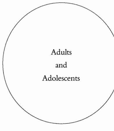
Figure 1: Institutional Expression

above all young people are a vital part of our worshipping communities today (Britain Yearly Meeting 2004 Minute 19).