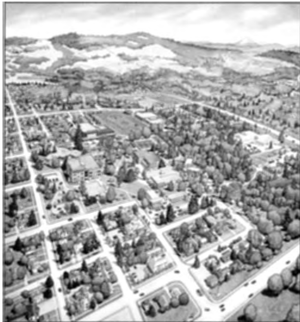
An artist's rendering of the George Fox University Newberg campus.

Early Willamette Valley Quaker settlers established Friends Pacific Academy in 1885. The college division was organized in 1891 to provide more advanced instruction.