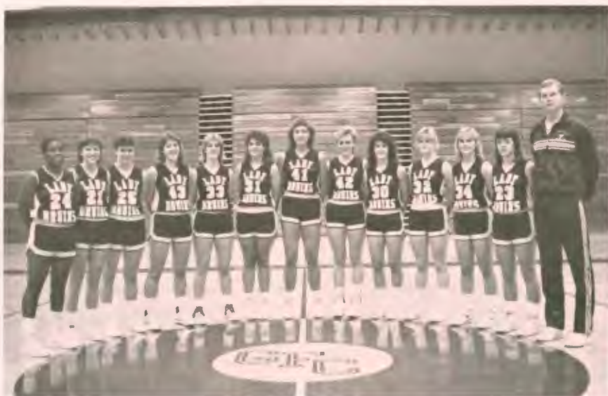
1986-87 LADY BRUINS

WOMEN'S BASKETBALL Miller Gymnasium • Wheeler Sports Center Newberg, Oregon