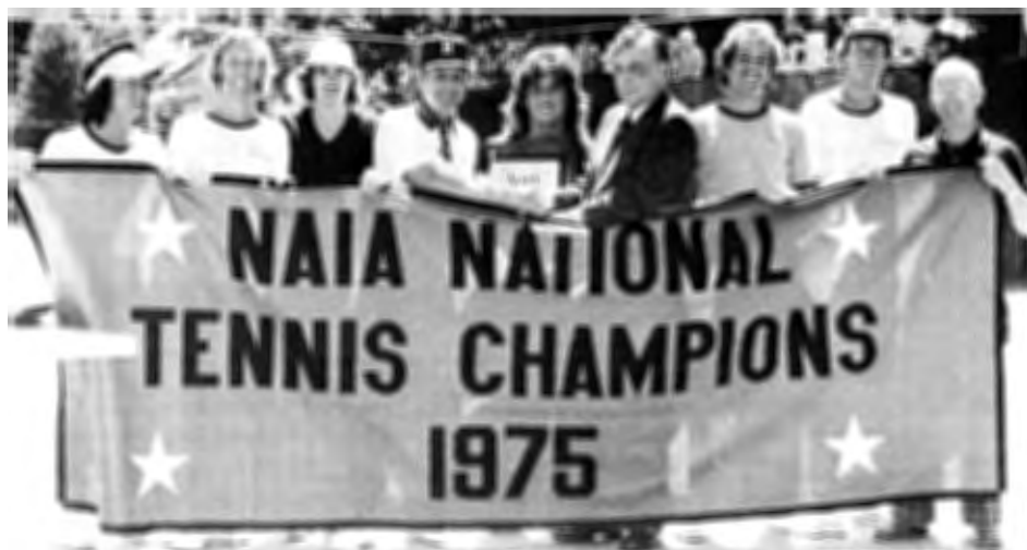
BULLDOGS DOMINATE . . . The University of Redlands CALIF tennis team continued to dominate the NAIA National Tennis Tournament as the Californians won their third consecutive title and ninth in the past ten tries.