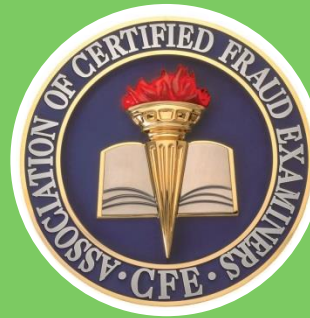
Certified Fraud Examiners