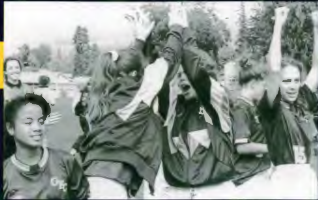
In just its second season playing soccer, George Fox moved into the NAIA Top-20 rankings after upset- ting the nation's No. 1-ranked team