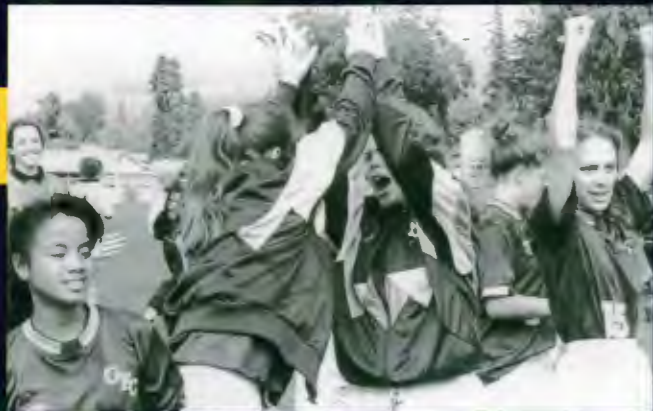
1992 In just its second season playing soccer, George Fox moved into the NAIA Top-20 rankings after upsetting the nation's No. 1-ranked team