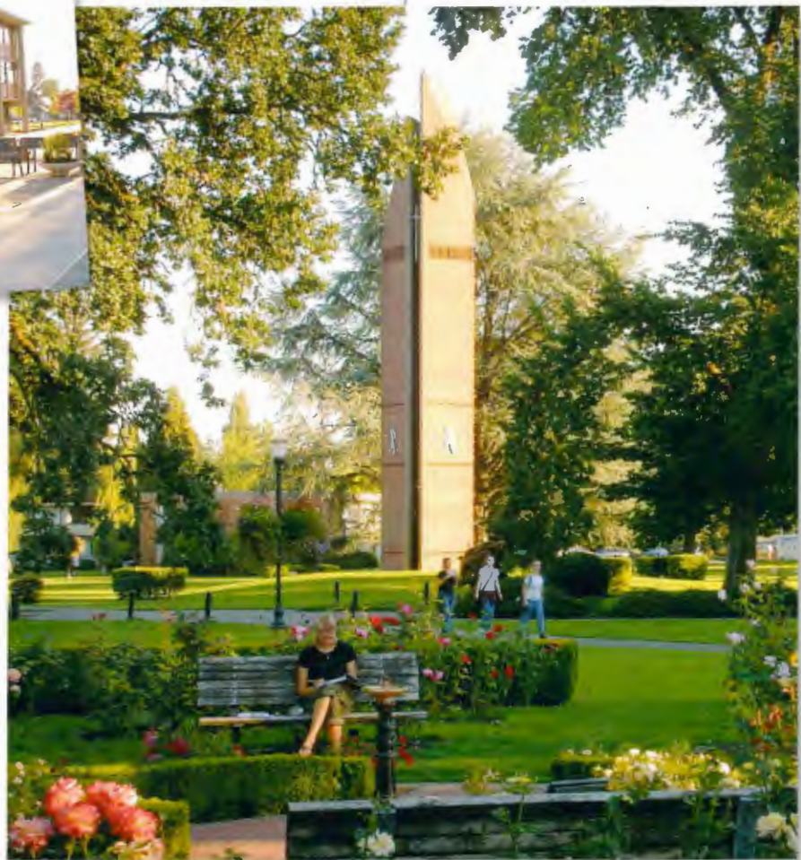
GEORGE FOX UNIVERSITY

George Fox offers bachelor's degrees in more than 30 majors, degree-completion programs for working adults, a seminary, and 14 master's and doctoral degrees.