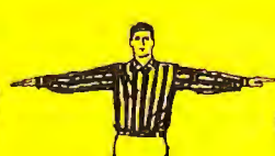
Unsportsmanlike Conduct; Illegal Participation