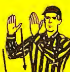
Intentional Grounding; Loss of Down