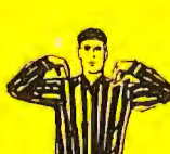
Illegally Kicking or Batting Loose Ball