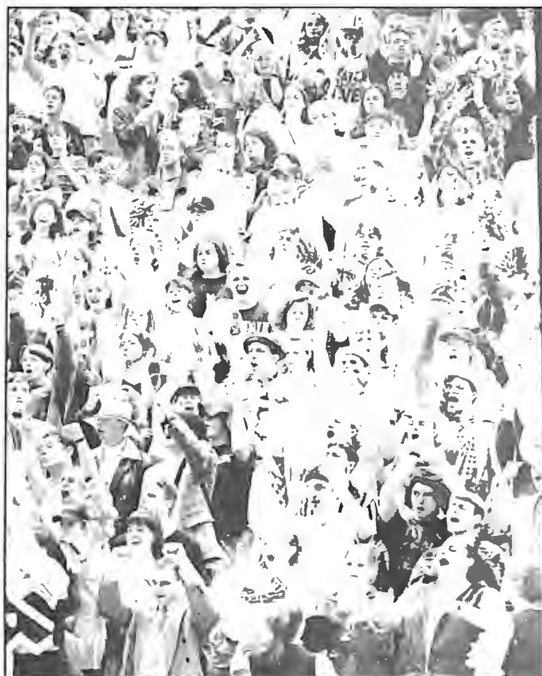
1996 Homecoming game crowd.

If I could change one thing about college basketball it would be: The 10-second rule to get across half court.