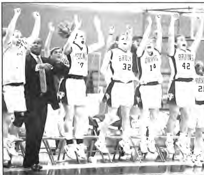
George Fox players celebrate upset of No. 1 Western Oregon.