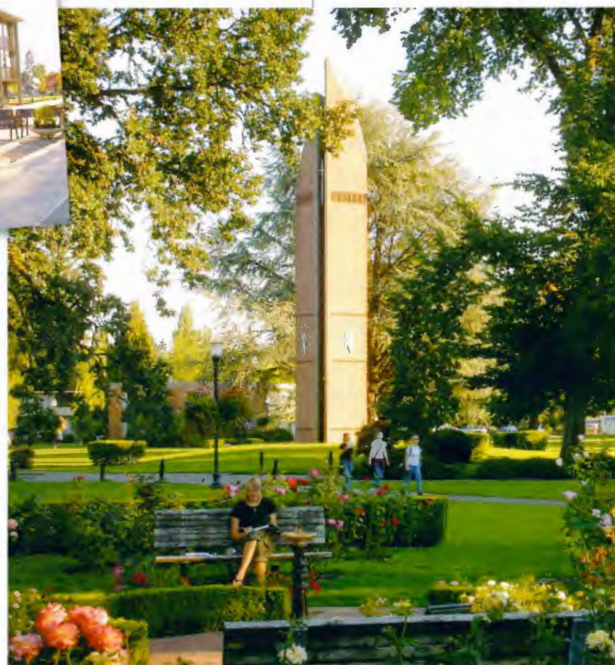
GEORGE FOX UNIVERSITY

George Fox offers unique programs. Every incoming freshman is provided a laptop computer to use and keep upon graduation. Students also can take advantage of the university's study-abroad program. George Fox pays transportation costs for a three-week