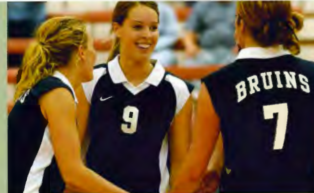
WHEELER SPORTS CENTER/ MILLER GYM

Entered by crossing a wooded canyon on a 200-foot bridge, the Wheeler Sports Center is the home of the George Fox Bruins volleyball team. The $2.7 million, 55,000-square-foot complex is the university's largest building.