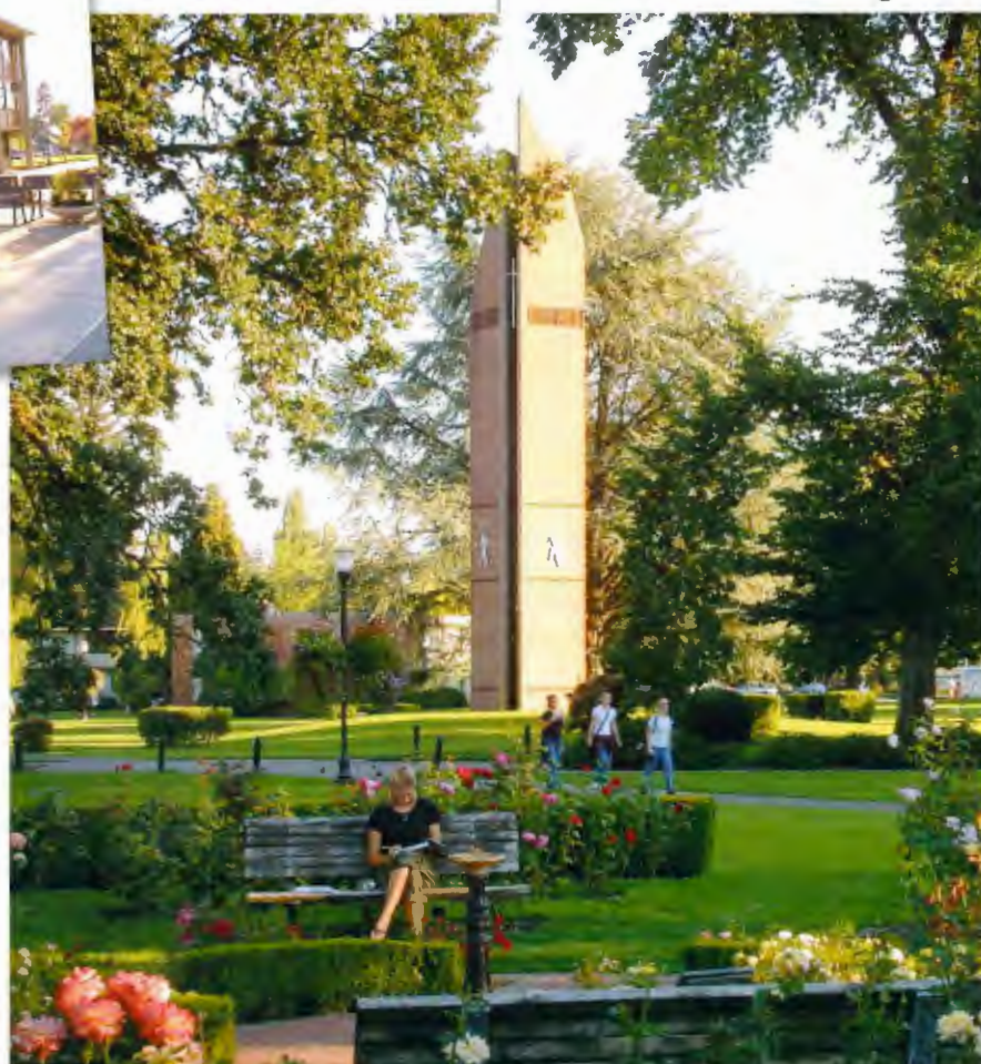
GEORGE FOX UNIVERSITY

George Fox offers bachelor's degrees in more than 35 majors, degree-completion programs for working adults, a seminary, and 14 master's and doctoral degrees.