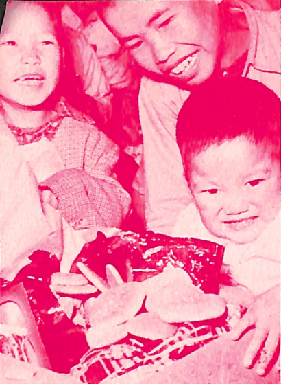
THREE BROTHERS AT CHRISTMAS TIME, THEIR PARENTS IN PRISON, AND NO ONE TO CARE FOR THEM—BUT OUR LOVING SAVIOUR GATHERED THEM IN.