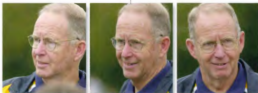
GEORGE FOX UNIVERSITY