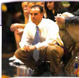
High School in Corvallis.