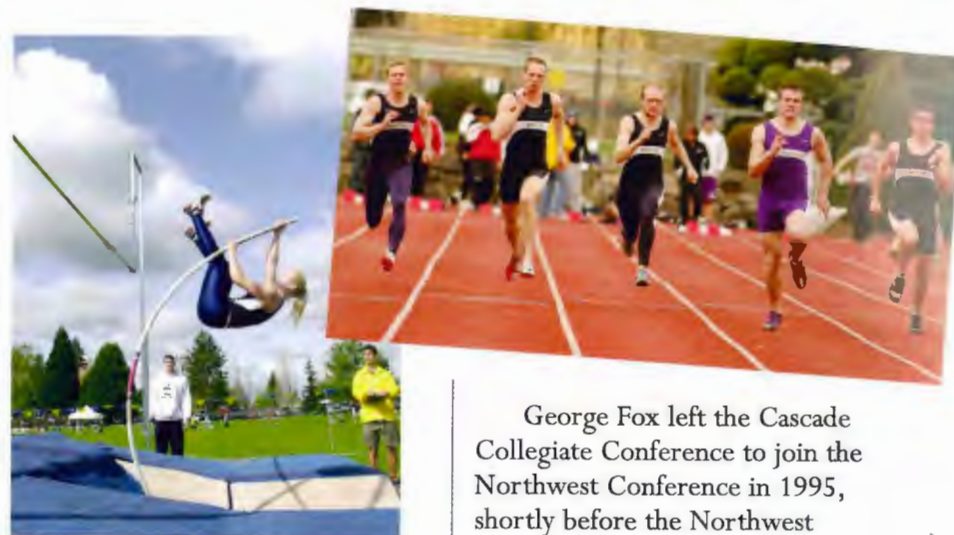
The Northwest Conference

George Fox University has been a member of the NCAA since 1995 when — along with the other institutions in the Northwest Conference — it elected to transfer its membership from the National Association of Intercollegiate Athletics (NAIA).