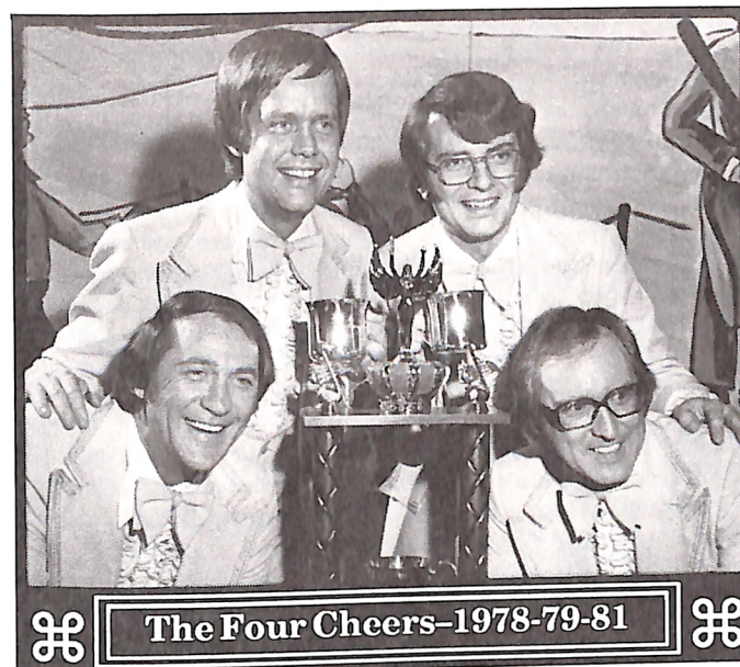
The Four Cheers-1978-79-81