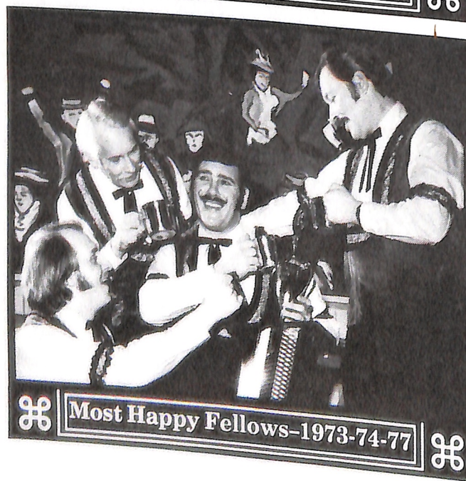
Most Happy Fellows-1973-74-77