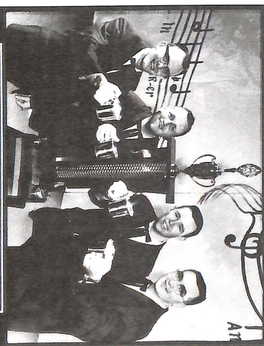
Bay Shore Four-1965-66