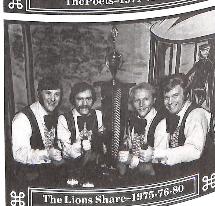
The Lions Share-1975-76-80