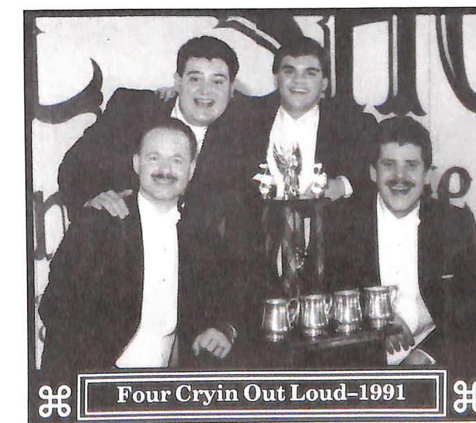
Four Cryin Out Loud-1991