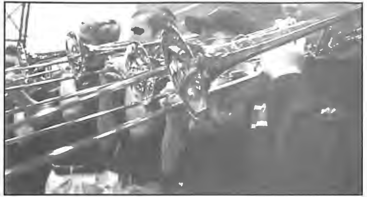
PEP BAND: The student-run George Fox Pep Band provides spirited entertainment for spectators before games, at timeouts, and at halftimes. Fans from visiting teams have commented that the George Fox Pep Band is the best at any Northwest Conference school!