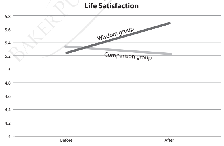
Satisfaction with life was measured with the Satisfaction with Life Scale—5. The graph shows a significant interaction effect, with participants in the wisdom group increasing more than those in the comparison group. See Ed Diener et al., "The Satisfaction with Life Scale," Journal of Personality Assessment 49 (1985): 71–75.