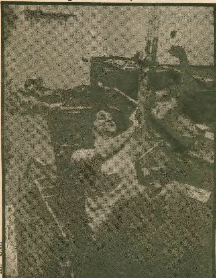
The blood drive, held on Oct. 27th, exceeded expected goal.