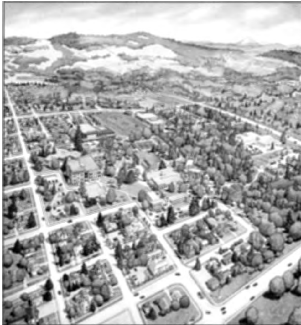
An artist's rendering of the George Fox University Newberg campus.

Early Willamette Valley Quaker settlers established Friends Pacific Academy in 1885. The college division was organized in 1891 to provide more advanced instruction.