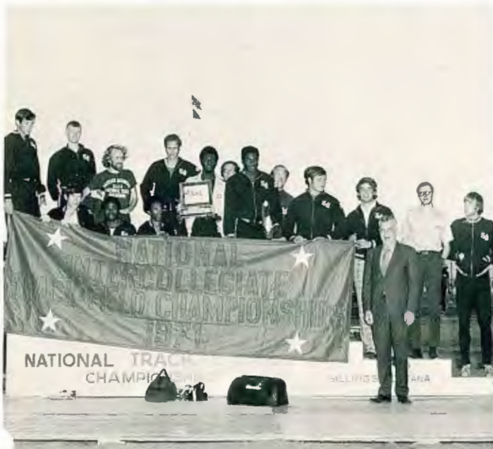
Members of the winning Eastern Michigan University track and field team proudly display their 1971 NAIA National Track and Field Championship banner after winning the Outdoor title at Billings, Montana.