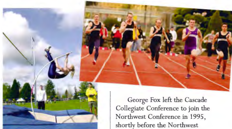
The Northwest Conference

George Fox University has been a member of the NCAA since 1995 when — along with the other institutions in the Northwest Conference — it elected to transfer its membership from the National Association of Intercollegiate Athletics (NAIA).