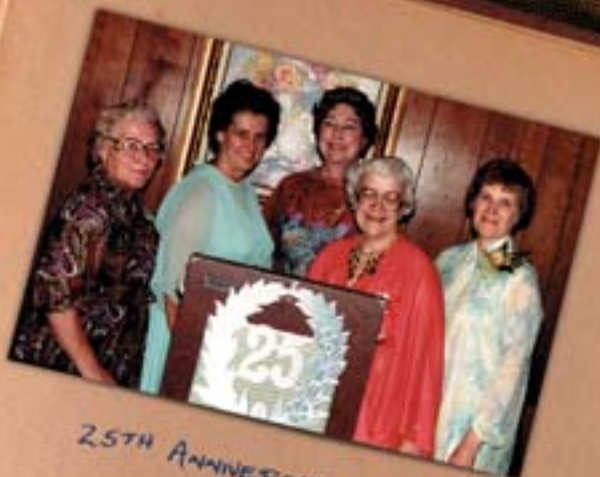
25TH ANNIVERSARY OF ACL