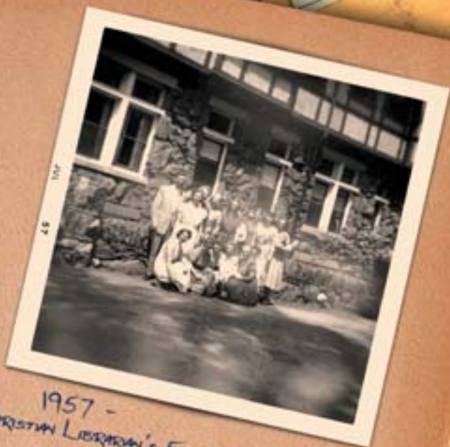
1957 - CHRISTIAN LIBRARIAN'S FELLOWSHIP CONFERENCE