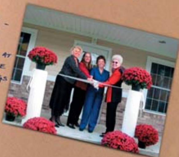
2005 - RIBBON CUTTING AT CEDARVILLE CROSSINGS